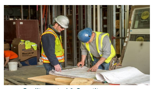
Quality control & Quantity surveyor