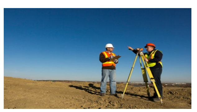
Site Surveying and soil testing.