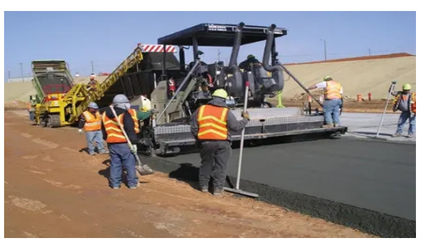
Road construction and Street Beautification